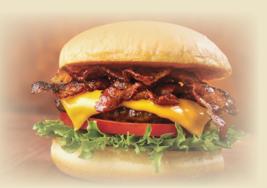
Prices are subject to change. $3.50 packaging fee for take out $3.50 fee on delivery orders